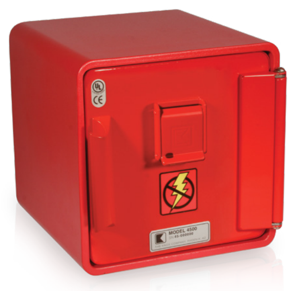
Single Lock, Surface Mount

The Knox Remote Power Box enables emergency responders to rapidly power down a building before entering. Designed to remotely operate the building's shunt switch, the Knox Remote Power Box supports electrical power disconnect for not only buildings, but also equipment and systems such as generators, power distribution, wind, solar power and telecommunications systems.