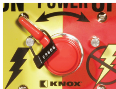
Lock-Out/Tag-Out Posts Accommodate a Tamper Seal